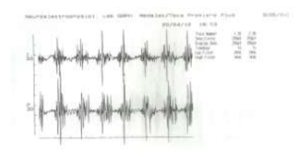
Figure 2. A record of surface electromyogram with alternating pattern (recording from flexor carpi ulnaris and extensor carpi radialis)

Figure 1. A record of surface electromyogram with synchronous pattern (recording from flexor carpi ulnaris and extensor carpi radialis)